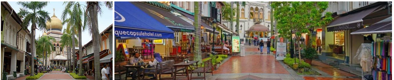
Kampong Glam Sultan's Mosque

Next Stop is Little India , a colourful, fragrant and vibrant district for the Indian community. The original occupants of this downtown niche were Europeans and Eurasians who established country houses here. Only when Indian-run brick kilns began to operate here did a markedly Indian community start to evolve. Today, Little India is still bustling with traditional businesses and religious centres. Stroll along the streets to see the traditional shops displaying Indian artefacts, clothing stores and restaurants.