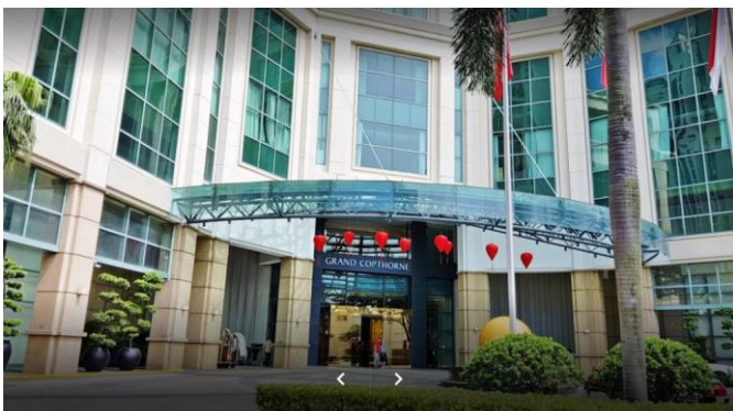
Grand Copthorne Waterfront Hotel ****

Overnight in Fullerton Bay Hotel***** OR Grand Copthorne Waterfront Hotel ****