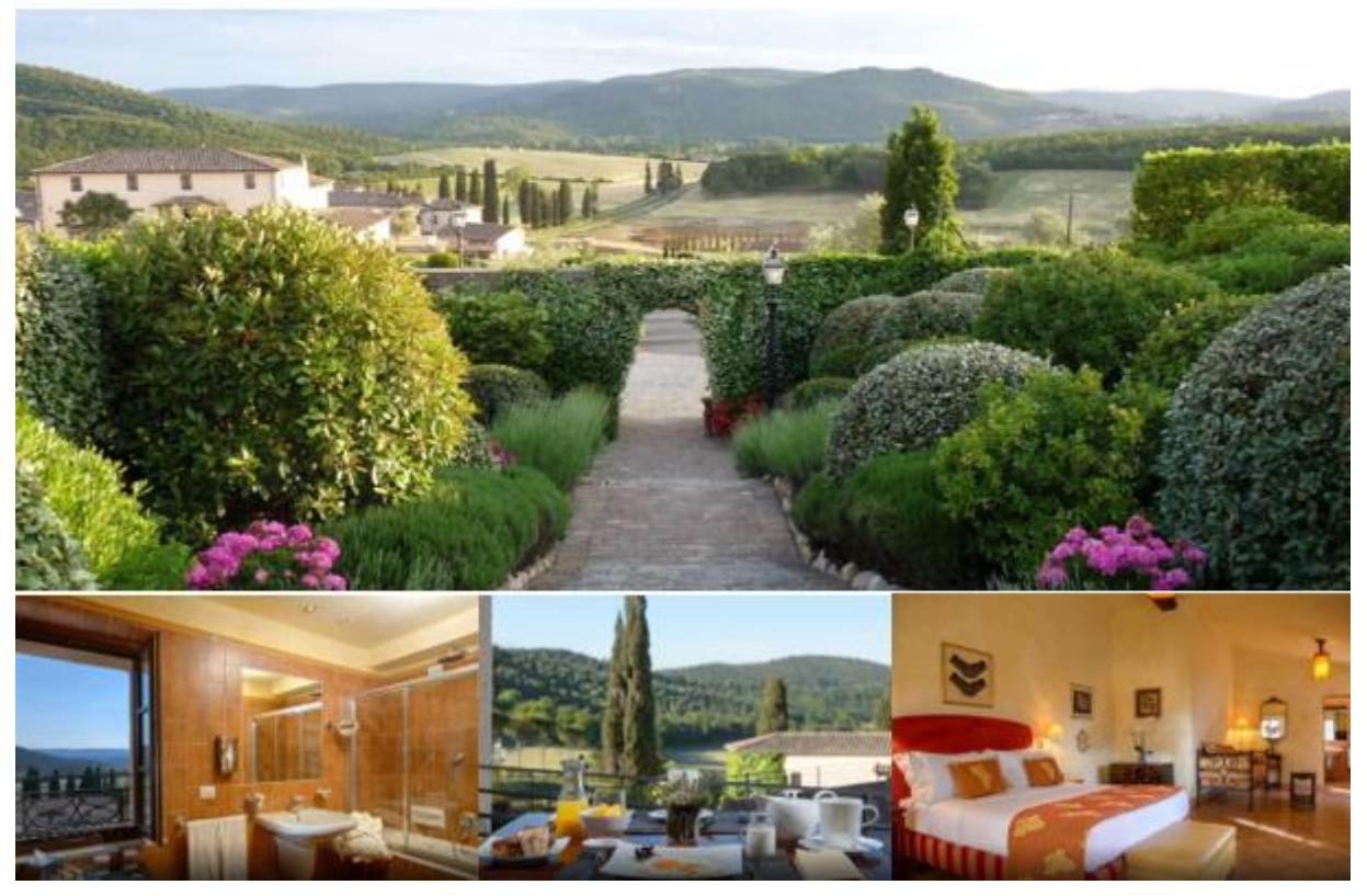
LA BAGNAIA GOLF & SPA RESORT ****, south of Siena.

At 7.30 pm we will serve an aperitif. The day will finish with a characteristic Italian dinner. I will choose the fine wines to go with it; after all, that is my background.