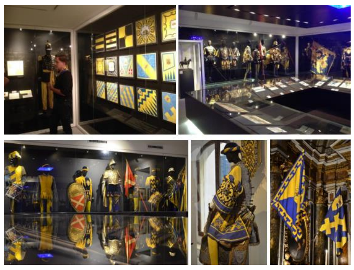
Reception by and visit of the Contrada della Tartuca, its chapel, its museum and its art treasures.

Tonight we will taste more of the atmosphere in Siena, have a look at the general rehearsal and eat with one of the contradas that will actually take part in tomorrow's race. The lots are always drawn at the end of May. In 2022 we dined with the contrada of The Panther and visited its museum and chapel. An ordinary mortal will never obtain entrance here and will definitely not get a private tour through these 'sanctuaries'. This is where we will find the Palios of the races this contrada won recently and in the past and this is where all important relics are kept.