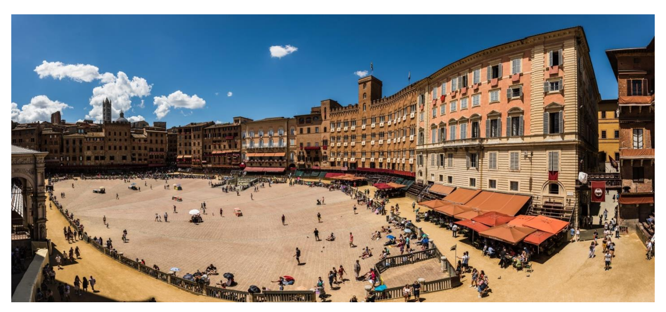
The Piazza del Camp, on the day preceding the Palio. Tomorrow afternoon the square will be filled with thousands of spectators.

Roundabout 4.30 pm we will be back in our hotel. A little time for yourself, before we drive to Siena at 6 pm. We will taste the atmosphere that will let us partake of a unique experience, IL PALIO. During the approach to Siena we will taste the mounting tension in this city in the days preceding the Palio. The neighbourhoods/guilds – called contradas – are out for one another's life in a manner of speaking. Who will win this year? Which rider and which horse will earn eternal glory by crossing the finish line first, tomorrow afternoon?