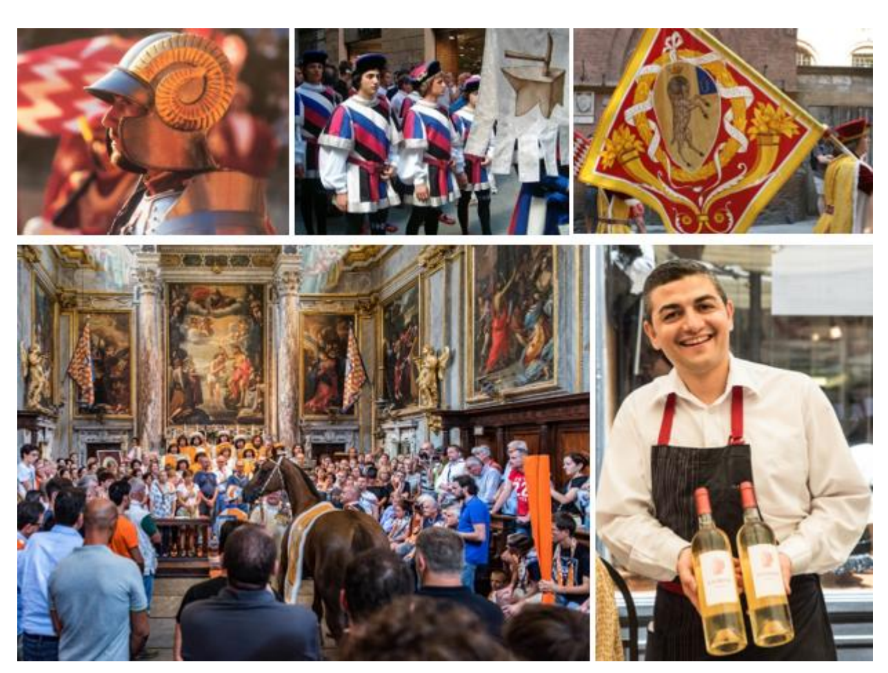
Folklore, tradition: blessing the horse. Il Palio, since 1287!

We will lunch at the well-known Osteria Le Logge near the central square. After that we will go to Francesca di Biondi Santi's Palazzo at the Piazza del Campo. From there we will see how ecstatic and colourful Italians, dressed in original attire, will fill the square. Standard bearers of all contradas will border the streets of Siena. In the course of the afternoon every horse will have been blessed in the chapel of its own contrada .