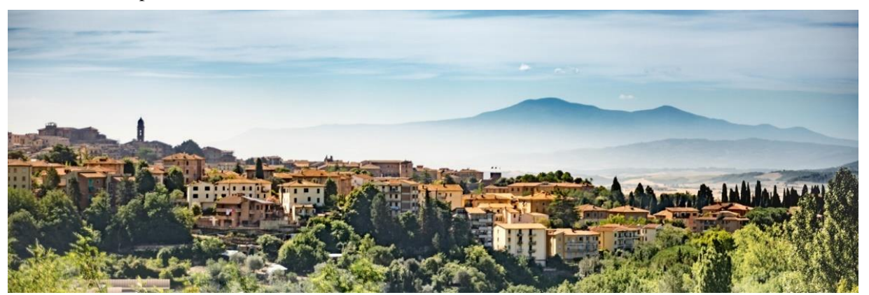
The morning mist is fading in Siena on the day after the Palio on July 3, 2017

On the morning of Monday July 3 we will have a delicious and copious breakfast and reminisce about yesterday's scene of battle. After the morning mist has disappeared there will be a wonderful apotheosis of our trip: at the end of the morning we are expected by Marchesi Antinori, one of Tuscany's most renowned wine producers.