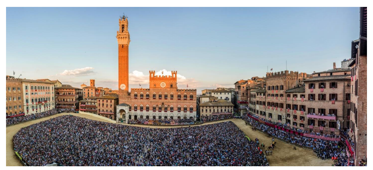
The Piazza del Campo, before the starting shot of Il Palio. Picture taken from Francesca Tagliabue's Palazzo.

We ( max 20 persons) will not stand among the thousands of people in the square. From the apartment and its balcony we will have the best places with a wonderful view of the whole Piazza, incl. start/finish.